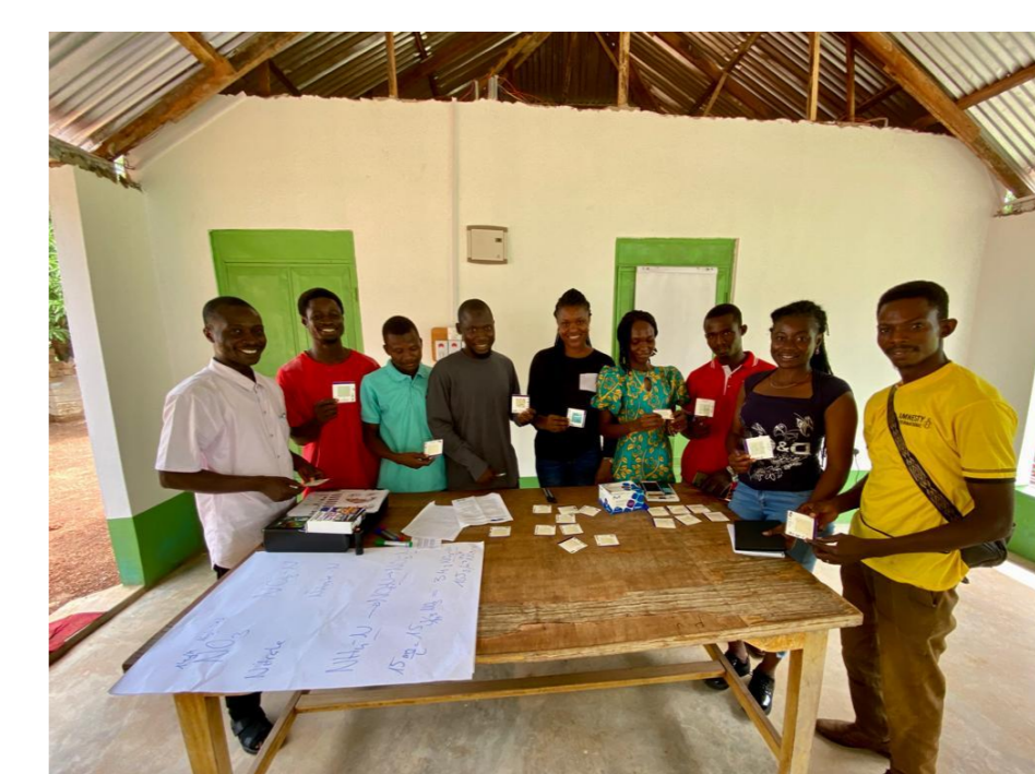
Co-design and co-creation of circular technologies. (Outcome B)