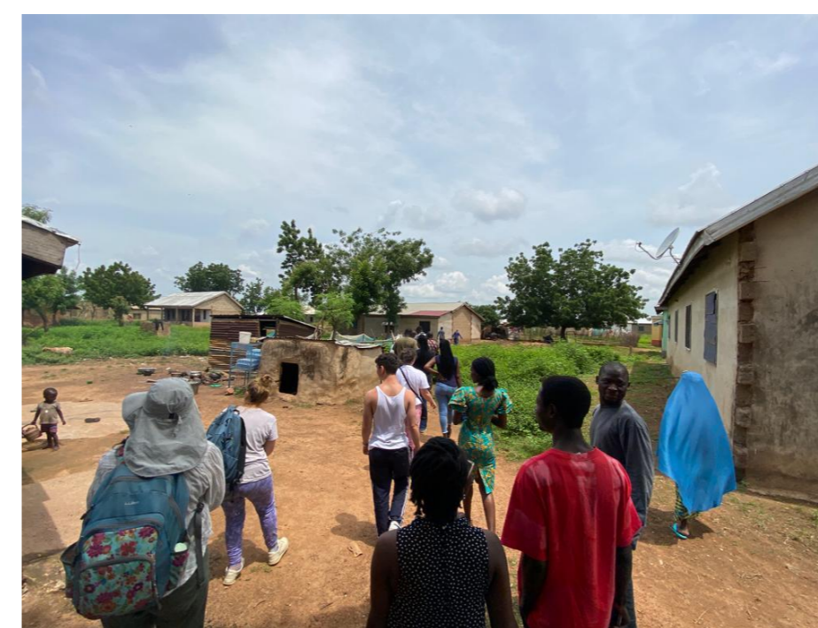
Assessment of local food system (Outcome A)

SO#4: Assess the impact of circular agri-food innovations on end-users to foster evidence-based urban food policy formulation for city region food systems in Africa.