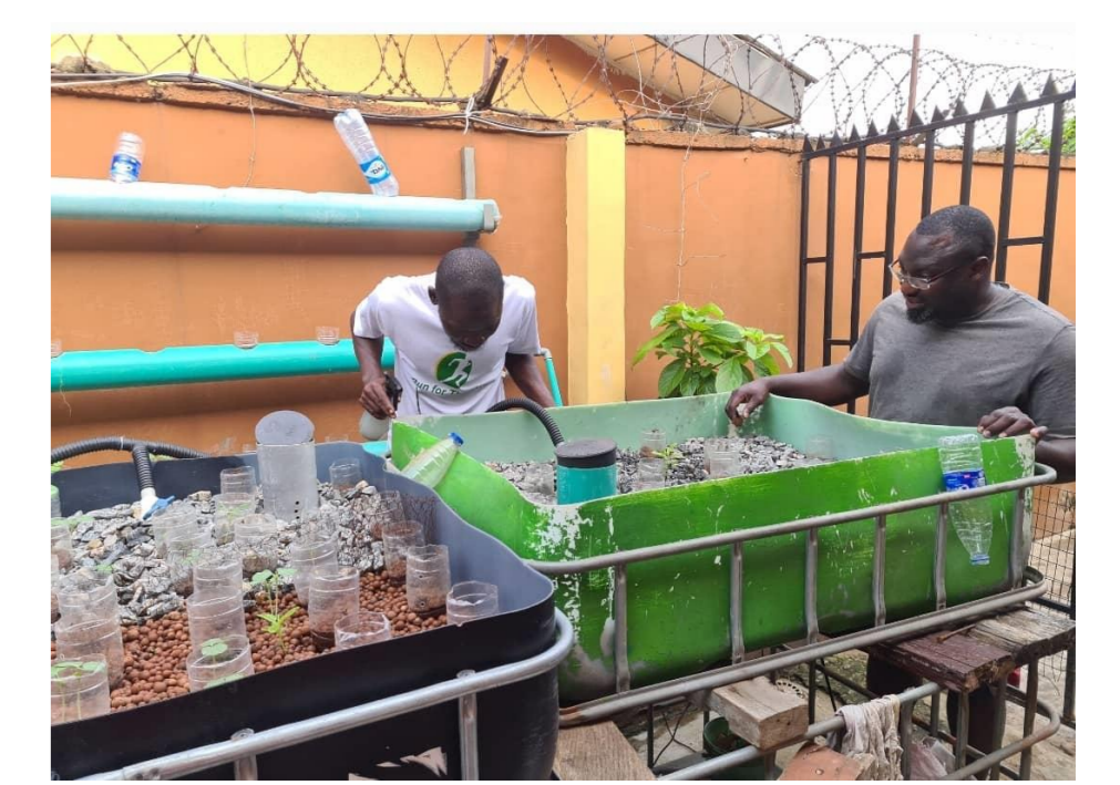
Incubate and accelerate agri-food innovation and entrepreneurship. (Outcome C)