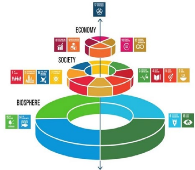
Figure 1: Relation of different domains within the Sustainable Development Goals (SDGs), biosphere, society, and economy and the connecting partnership arrow.

The conference is built around the graph of the Sustainable development Goals in figure 1. In this graphic the SDGs fall apart into 4 categories: 1) Biosphere (the bottom ring); 2) Society (the middle ring); 3) Economy (the top ring) and 4) SDG 17 for partnerships that is connecting all three rings like a pin. Each of these themes will be introduced by highly relevant and impactful keynote speakers.