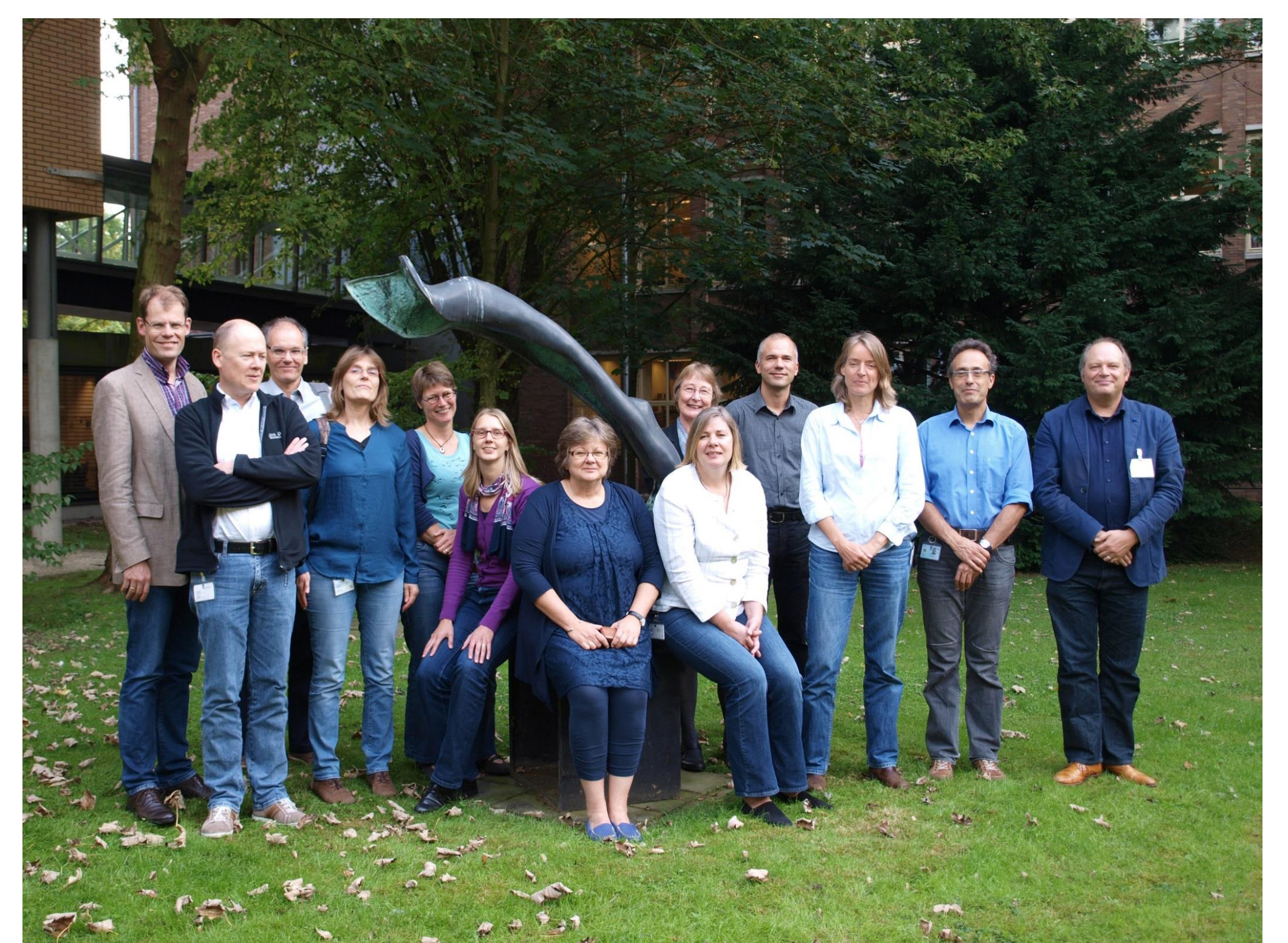
The project participants at the start up meeting in October 2014

A 'one health' web-based framework that facilitates the exchange of epidemiological, clinical and molecular data from both human and animal cases of psittacosis will be constructed, evaluated and implemented to improve source finding by infectious disease control professionals. Moreover in depth knowledge about human and veterinary psittacosis will be gathered. The project will run for 4 years (October 2014- September 2018).