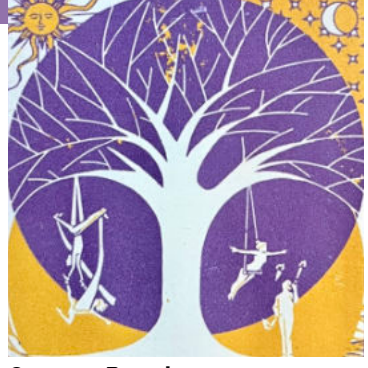
Common Barack Droevendaalsesteeg 77

How do dreams feel? You might remember the whole storyline or just fractions, or have a blurry memory of it; but you're always left with a feeling. As we all carry these feelings in our bodies into the awakened world, Beatreece's circus will now carry them one step further and liberate dreams into movement. Beatreece is a Wageningen-based circus collective that will premiere their new show How do dreams feel? at Roomservice 2024.