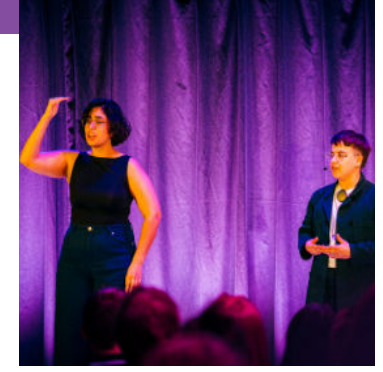
Onder de Magnolia Nassauweg 13