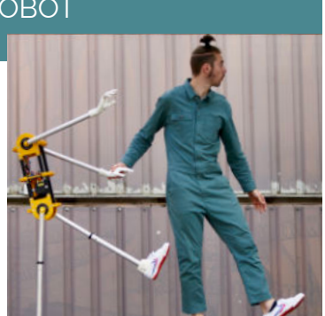
BBLTHK Stationstraat 2

This project is co-produced by V2_ Lab for Instable Media.