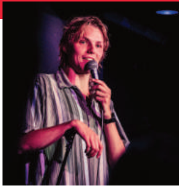
Oranjehof Rouwenhofstraat 15