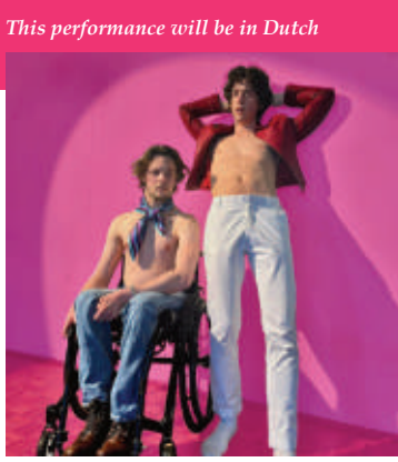
Bolus 9 Bowlespark 9

'Je Wilt Me' is een theatraal concert van ZwartGat. Ze zullen thema's bespreken zoals liefde, seks en het gevoel om gewenst te zijn. Ze gaan veel uit en raken vaak gefrustreerd over seks. Ze zoeken ernaar, maar slagen er bijna nooit in om aan hun eigen verwachtingen te voldoen. En als het wel lukt, is het niet genoeg. Is seks echt waar ze naar op zoek zijn? Of verlangen ze naar een diepere verbinding? Het laat hen achter met een gevoel van eenzaamheid, met of zonder seks.