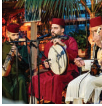
Grote Kerk Markt 1

The Amsterdam Andalusian Orchestra, performing as a quartet, plays various musical forms from Granada to Baghdad spanning different time periods and styles. From the rich Arabo-Andalusian repertoire to mystical Eastern music, and from sophisticated improvisational music from the Arab world to folk music from the Maghreb.