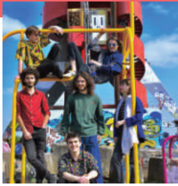
Wolfswaard Aan de Rijn 12

Since 2017 Citrus Blossom is deeply committed against social inequalities and the horrors of war, as their original sociopolitical lyrics varies between grit and tenderness. This quintet always pulls off with a raw essence of improvised songs. The band is made up of eclectic international musicians who are inspired by Rock, Jazz, Folklore and Pop, to compose the unique dialogue between saxophone and violin inspired by eastern traditional voice lines.