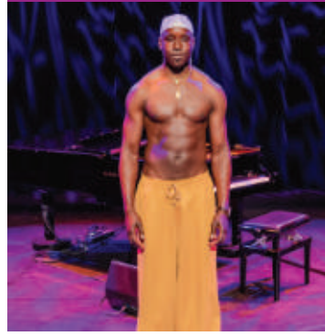
BBLTHK Stationstraat 2