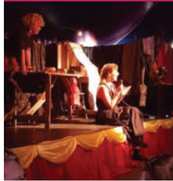
Witte Wilma Wilhelminaweg 24

This Is No Ant is a storytelling and puppetry show that is not really a show. It is a love letter to chaos, an ode to fantasy and a serenade to ants. Come dive with us in the depths of wonder, listen to slightly feminist stories and celebrate imagination with us. If fantasy is only for children, then let us be children!