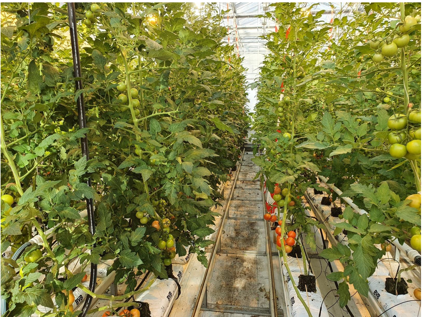
Figure 1. Tomato crop (Roterno) for the VitalFluid (left) and reference treatment (right) at 13-10-2021

likely all mineral N is taken up by the plants which resulted in complete depletion of the root zone. The total quantity of N being available is not sufficient to cover the demand, which is shown in the crop as N-shortage symptoms. The plants have smaller and less leaves, and the leaves are paler green (right side of Figure 1). To avoid a complete standstill of the plants in the reference, chilean nitrate ( \text{NaNO}_3 ) was added in addition to the organic nitrogen fertilizers, to compensate for the lack of microbial production of nitrate. The lack of microbial conversion of nitrate is possibly due to at one hand a lack of oxygen in the rootzone. It was observed that the substrate is relatively wet and likely the \text{O}_2 consumption by the roots and in addition of the microbiology depleted the oxygen concentration completely. In addition, it might also be possible that the required microbial community could not have settled properly, which is a general problem of substrates. All by all the too low activity or presence of the microbiology in the rootzone, caused suboptimal conditions and too low productivity of the crop.