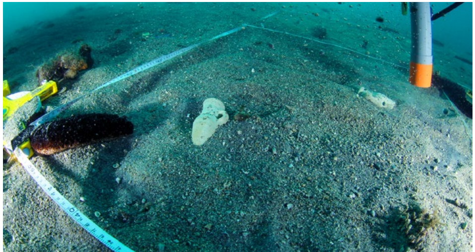
Drilling underwater (above) and discovering Roman remains (below).

'Suddenly jars turned up – a Roman treasure trove'