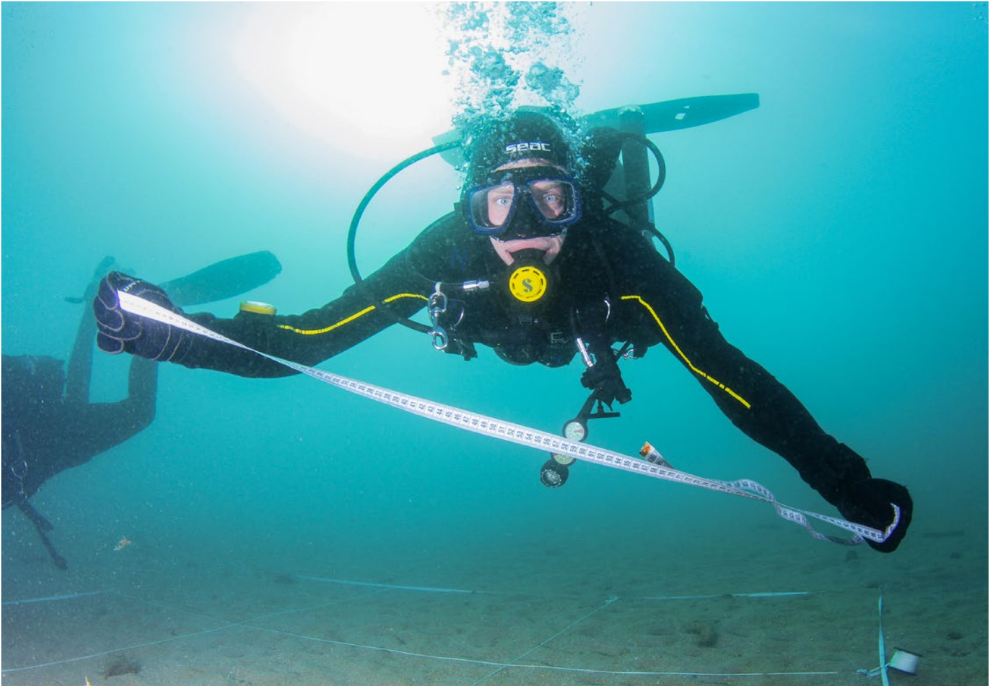
Using a tape measure to check whether the grid on the sea floor is the right size.