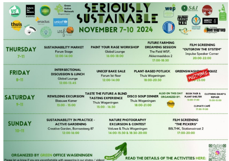
Figure 3: Events organized during the Seriously Sustainable Week (SeSu) 2024.

The Intersectional Discussion & Lunch was organized in collaboration with Thalia, the upcoming feminist association in Wageningen. It entailed a thought-provoking discussion that highlighted how social issues we encounter these days, like feminism and sustainability, are in fact interconnected. The aim was to include people from different backgrounds and to show that intersectionality must be considered in sustainability-related issues. This event promoted inclusive and equitable approaches to sustainability, while also empowering advocacy for systemic change. Additionally, to SDG 4, SDG 12, SDG 13, this event also had an impact on SDG 5 and SDG 10, due to the discussion looked to promote the social, economic and political inclusion of all, irrespective of age, sex, disability, race, ethnicity, origin, religion or economic or other status.