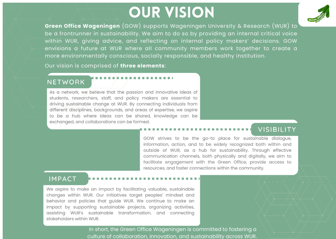
Figure 1: Green Office Wageningen (GOW) Vision comprised of three elements: Network, Visibility, and Impact.

GOW is dedicated to reinforcing WURs sustainability strategy outlined in the corporate social responsibility (CSR) agenda, as outlined in the WUR sustainability report 2022 (e.g., Table 2-1). It supports the achievement of sustainability-related goals defined in key WUR frameworks, such as WUR's Strategic Plan , Food and Beverage Vision , Energy Vision 2030 , Circular Economy Vision , Green Vision , Gender + Equality Plan , and Education Vision . Additionally, GOW actively contributes to the United Nations Sustainable Development Goals (SDGs). This report provides an overview of GOWs activities, including their connections to specific SDGs, and alignment with various WUR plans and visions.