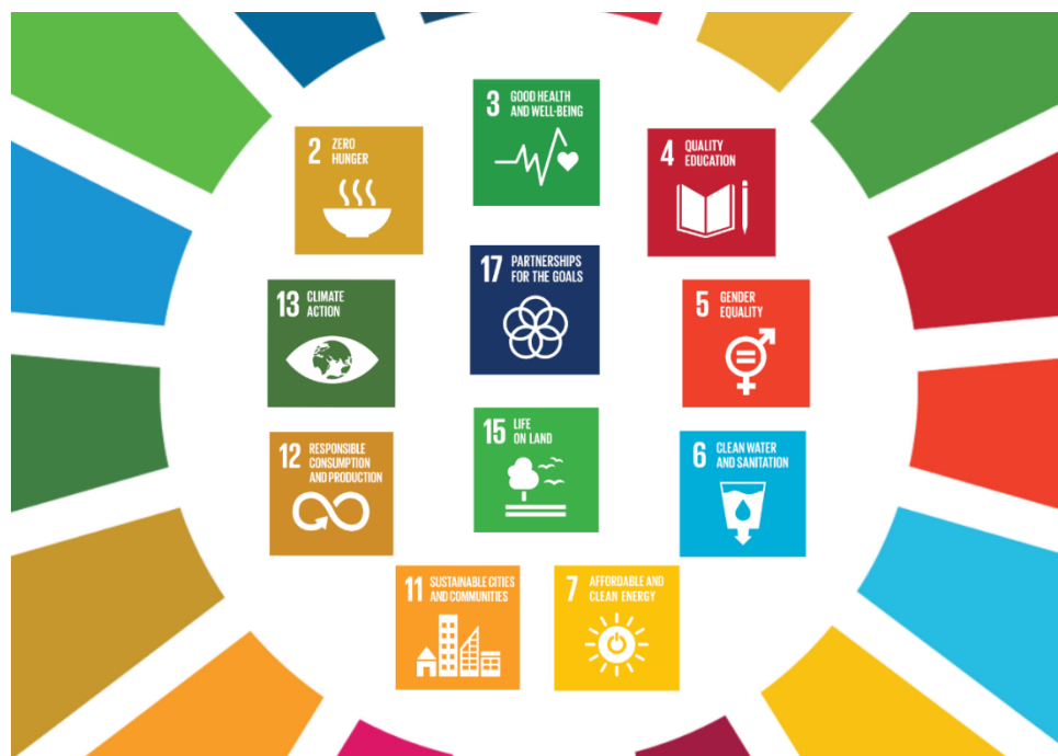
Figure 2: The Sustainable Development Goals that the Green Office Wageningen activities contribute to.