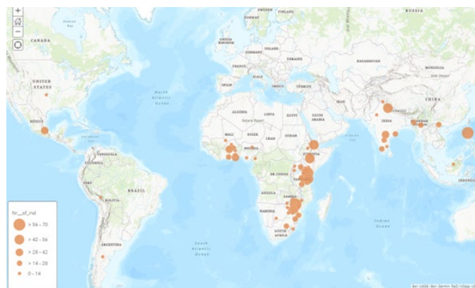
Figure StoryMap of global sources and local ecological indicators on weather forecasting for small-scale farm decision-making.