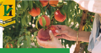
Faculty of Horticulture