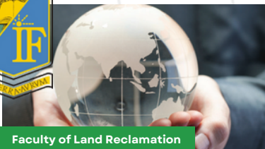
Faculty of Land Reclamation and Environmental Engineering