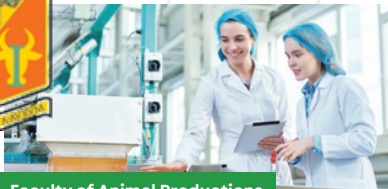
Faculty of Animal Productions Engineering and Management