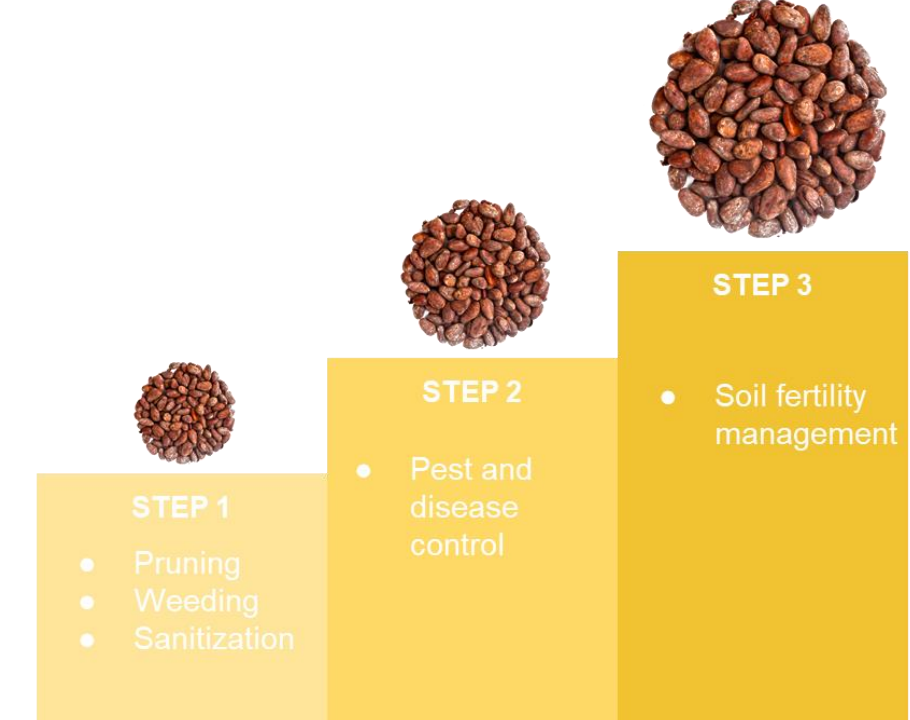
Figure 1 - A stepwise approach. Inspired by K. Giller (personal communication, June 7, 2022)