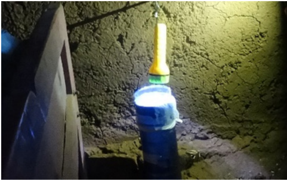
Malaria trap in a bedroom of a citizen science volunteer in Rwanda.

dropped. The findings are in line with research on trust in science and the role of knowledge during the Covid-19 pandemic, which similarly stress the importance of accessible, trustable, and consistent information in times of high uncertainty during which people are sometimes asked to adhere to drastic measures 1 .