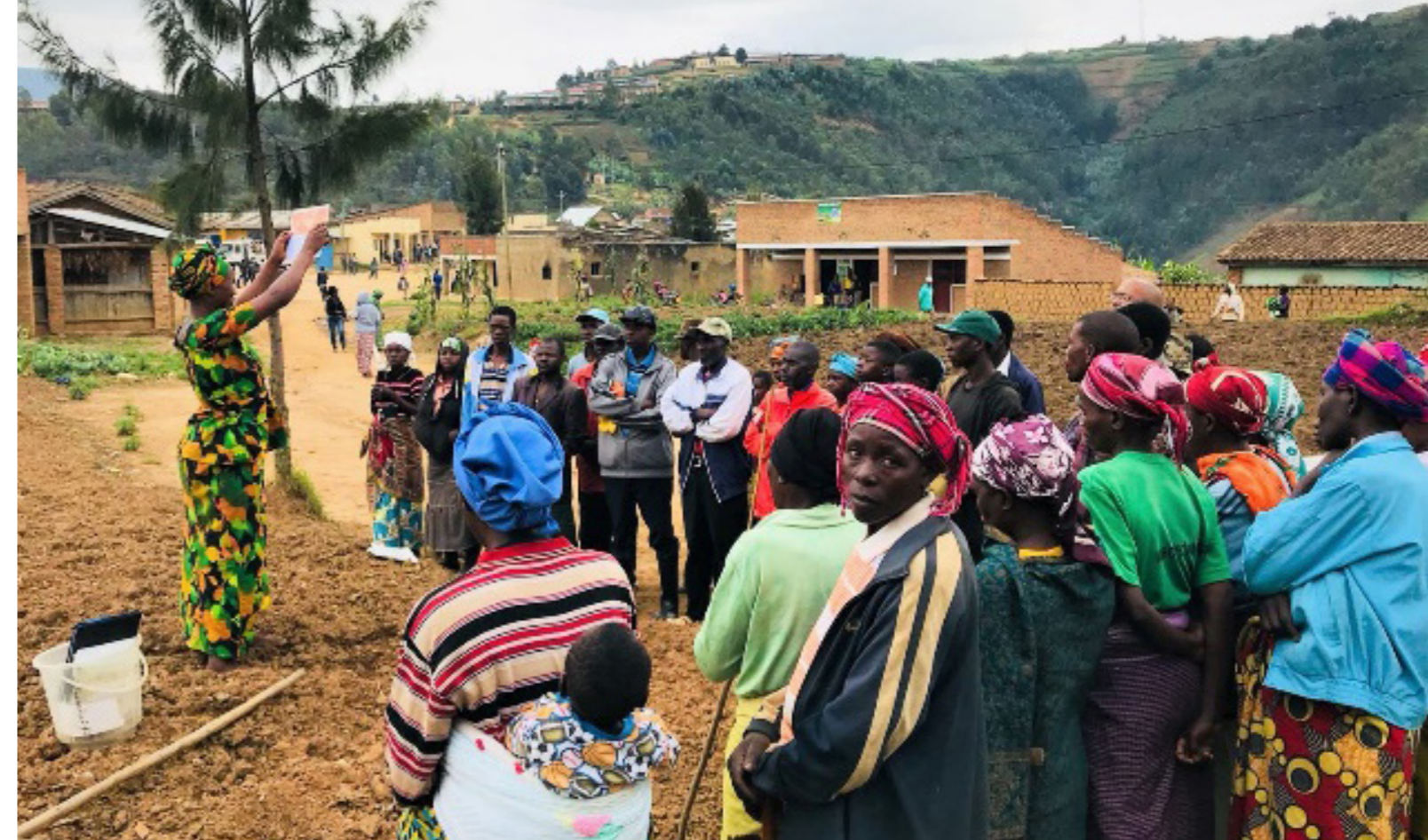
Community training on agricultural practices in Rwanda (Photo: ITA Rwanda).

Results from an experimental game with Rwandan banana farmers showed that farmers trying to save money on disease prevention early in the game, would later have to invest much more in control or lose their banana crop all together. Worse, not only the individual farmer lost more, but so did their fellow players. In other words, one person's failure to contribute to the collective goal to prevent BXW disease caused harm to everyone (Galarza-Villamar, McCampbell, Galarza-Villamar, et al., 2021).