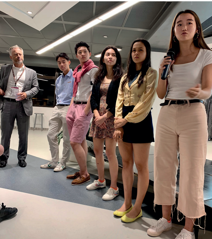
CIS students speaking at the launch of the school's whole school sustainability audit in September 2019

Other low-cost measures included setting up student groups across the whole school. These have had a tremendous impact by engaging and harnessing interested students to make a difference to their school and local community. Having some staff volunteer to help some of the logistics of these groups, especially in Primary, is also key to its success.