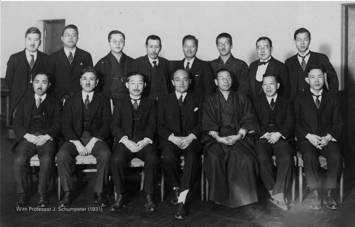
With Professor J. Schumpeter (1931)