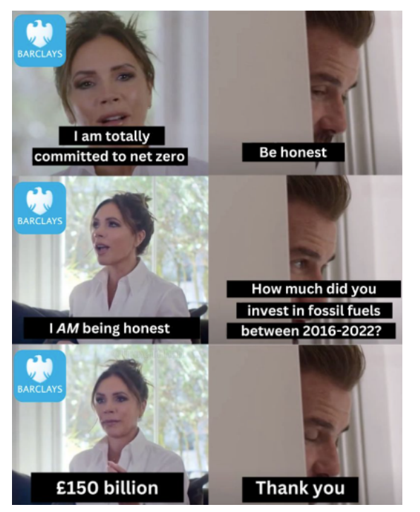
Figure 1: Meme about investments in fossil fuels [1].

So please grab yourself a sustainably sourced, low-carbon coffee and sit down with us so we can collectively address the elephant in the room: