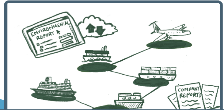
Industry self-regulation Trend analysis, Informational governance, Simulation of challenges

Fostering Environmental Stewardship among Antarctic tourism governance actors and institutions