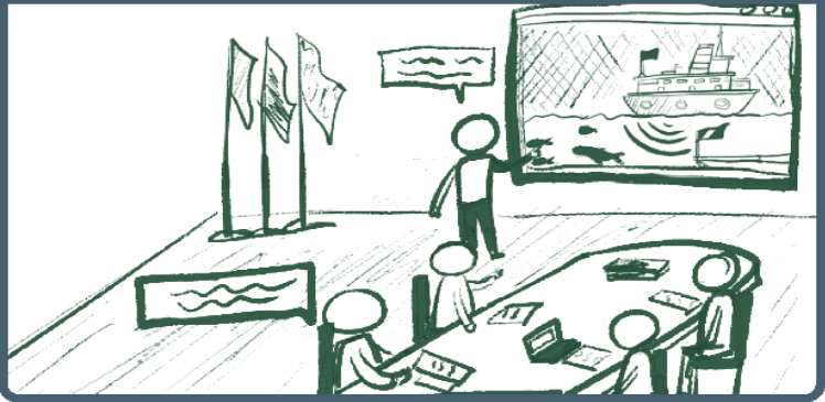
State-regulation of ship-borne tourism Regulatory and governance analysis, Policy proposals